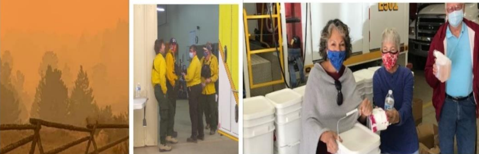
GVFD fire crew available and ready for the Camerson Peak Fire, views from the Gate 8, volunteers handing out supplies after mandatory evacuation was lifted.