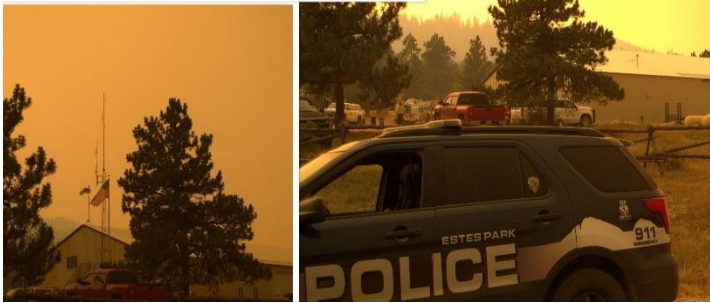
Support from all over being brought in to provide assistance