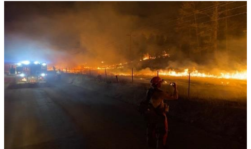
GVFD fire crew along Boy Scout Road near Shambala