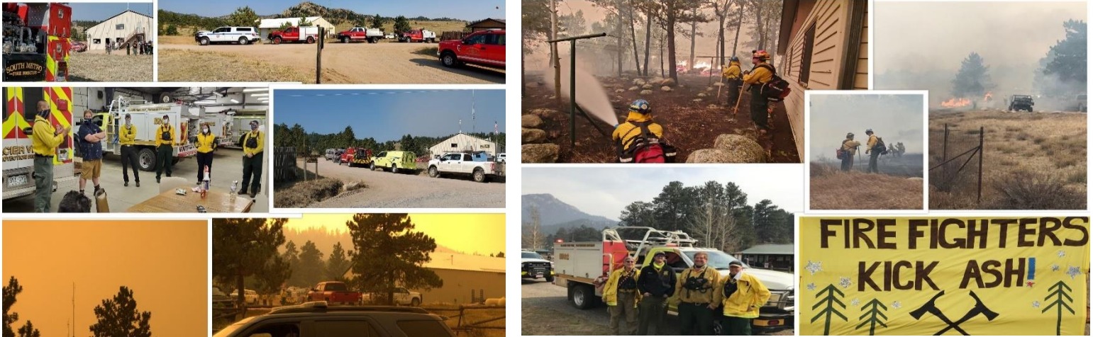
GVFD members deployed to assist Red Feather Lakes VPD with fire suppression around Bellaire Lake in the Poudre Canyon, structure protection in the Poudre Canyon, and provide assistance to Estes Park with the East Troublesome Fire. A very welcoming thank you sign.