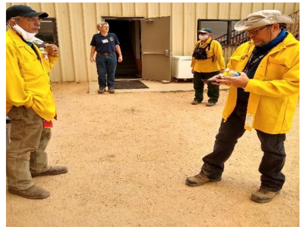
GVFD Board members assisting at the fire station during Cameron Peak Fire